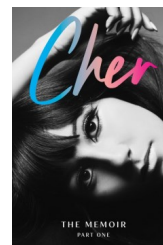
Cher: The Memoir, Part One by Cher Releases 11/19