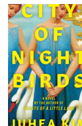
City of Night Birds by Juhea Kim Releases 11/26