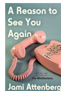
A Reason to See You Again by Jami Attenberg Releases 9/24