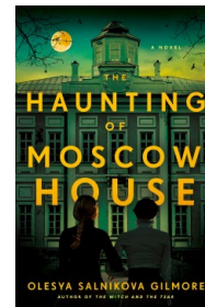
The Haunting of Moscow House by Olesya Salnikova Gilmore Releases 9/03