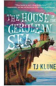
The House in the Cerulean Sea by TJ Klune Releases 9/01